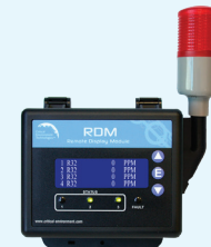
Remote Display (RDM-L2)