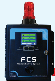
Flexible Control System (FCS)