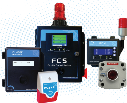
ChillSense, the complete solution

Talk to one of our gas detection experts today to learn about compliant gas detection solutions.