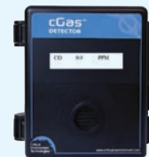
cGas Detector (CO)