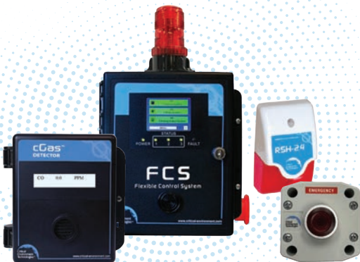
BoilerSense-NE, the complete solution

Stay compliant, reduce risk, and safeguard boiler rooms. Trust the gas detection experts to keep your critical environment safe and secure.