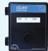
cGas Detector (CH 4 )