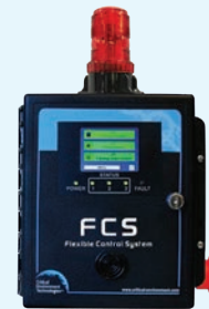
Flexible Control System (FCS)