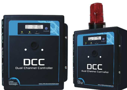
DCC shown with Option L

The DCC Dual Channel Controller is a comprehensive and dependable, self-contained system that offers one or two channel configurations for monitoring toxic, combustible and solid state refrigerant gases with straight-forward control functionality for non-hazardous, non-explosion rated, commercial and light industrial applications.