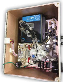
Inside of the DCC-MRI showing the LPT-A with Oxygen sensor.

CET-715A-SDP Sample Draw Pump Calibration Kit for 17, 34, 58, 74, 103 L cylinders, 1.0 LPM demand flow regulator & adapter to fit 17 L cylinder